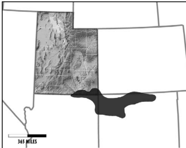
ANCESTRAL NAVAJO TERRITORY