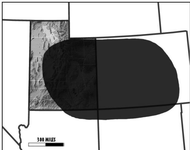
ANCESTRAL UTE TERRITORY